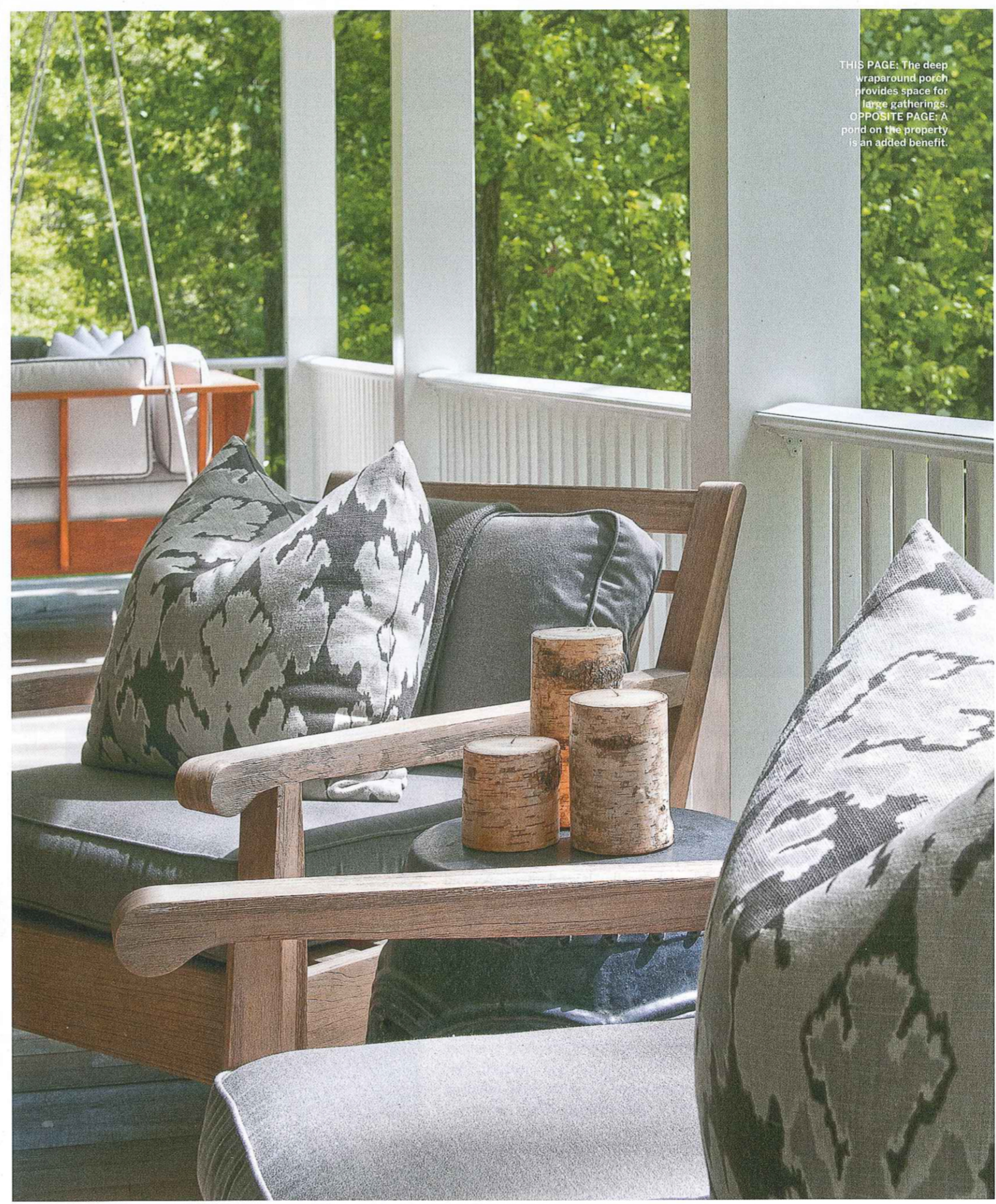
THIS PAGE: The deep wraparound porch provides space for large gatherings. OPPOSITE PAGE: A pond on the property is an added benefit.

Thoughtful design cleverly connects a family's home with its lovely surroundings