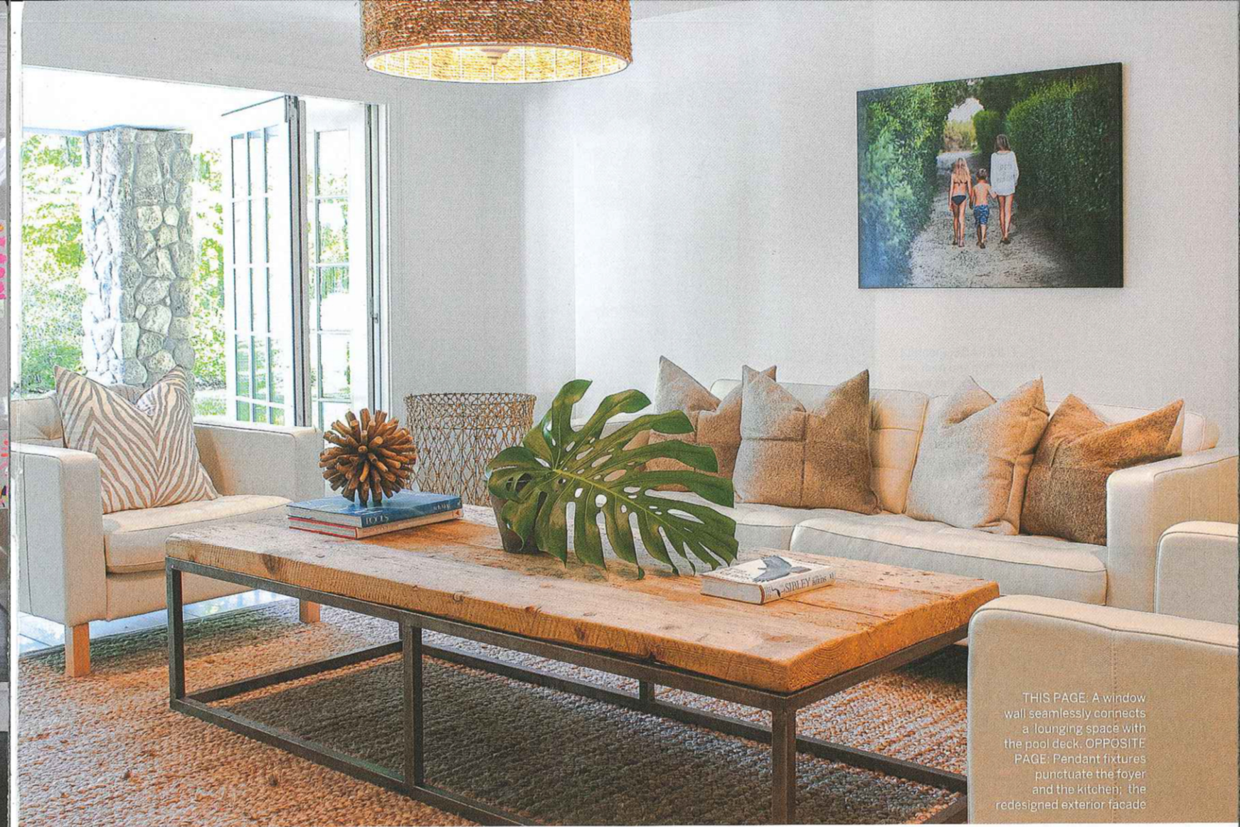
THIS PAGE: A window wall seamlessly connects a lounging space with the pool deck. OPPOSITE PAGE: Pendant fixtures punctuate the foyer and the kitchen; the redesigned exterior facade

The buyers were in a hurry. Needing to find a home for their family and nearly full-term with their third child, the wife was shown a place on a quiet road in New Canaan. The Silvermine River flowed through a pond at the back of the property and the lot's topography was fairly level, making most of it usable for outdoor play. Since the family loves swimming, canoeing and being outside, the location was appealing.